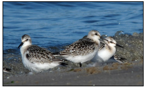
Sanderlings — one of many species of shorebirds that stop at Presqu'ile

We welcome you to explore the great diversity of habitats and bird life Presqu'ile has to offer. Reliable locations to see birds on the peninsula are specified in this pamphlet.