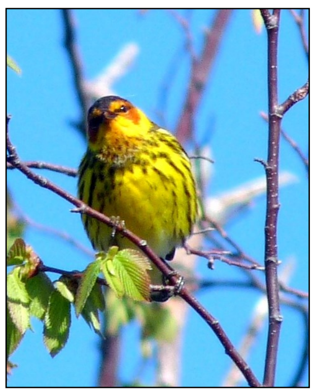
Cape May Warbler